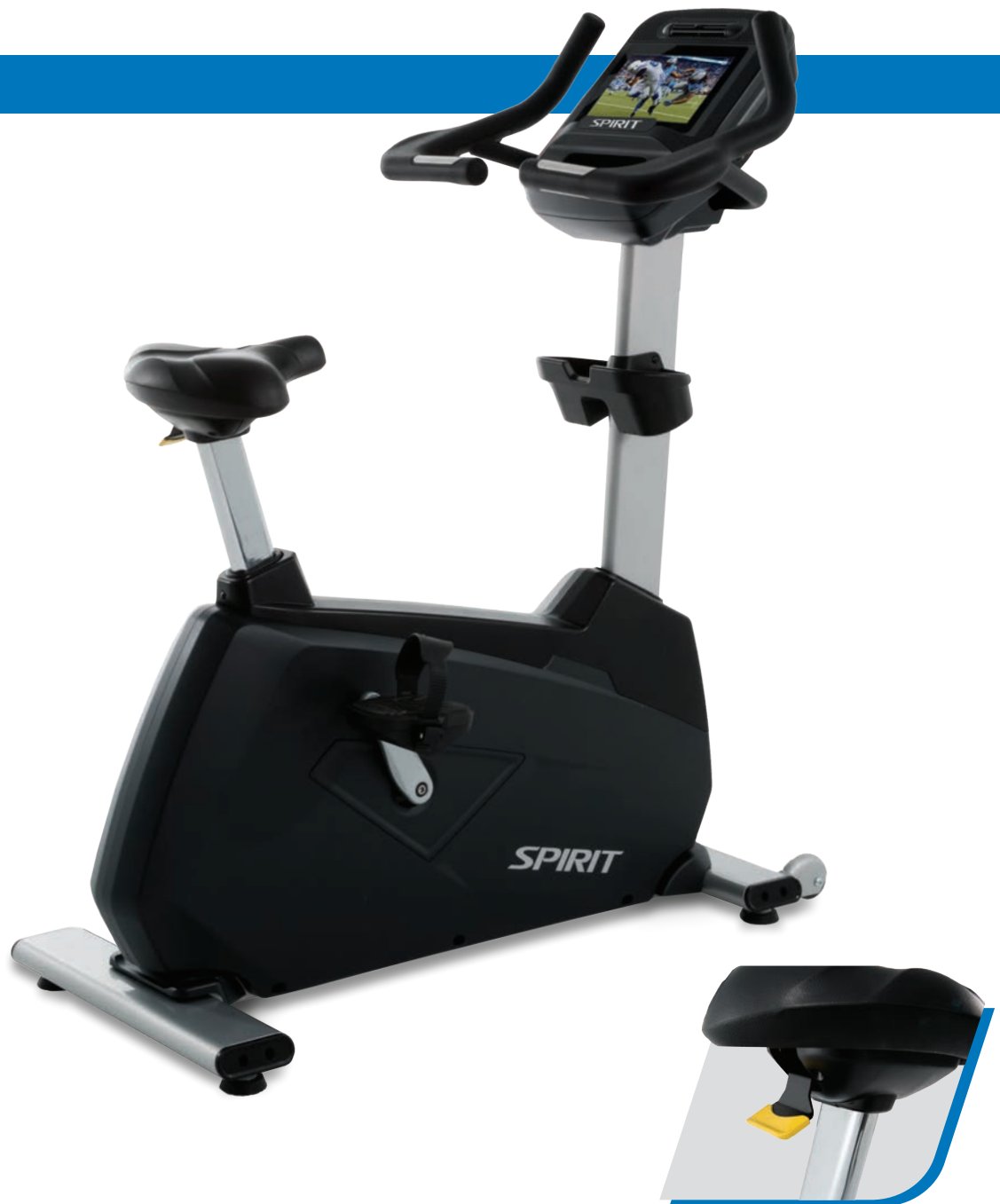
Easy Seat Adjustment

Users get the best of both in motivation and entertainment with the CU900ENT Upright Bike. The 10.1" touchscreen display allows users to watch TV, surf the internet and stream music while they work out. Three workout display modes give users plenty of feedback on their performance and progress. Commercial-grade pedals, cranks and bearings provide outstanding function and durability.