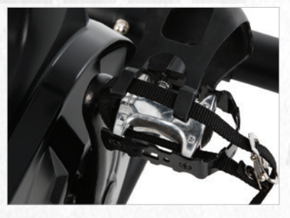
Standard Pedal Toe Cage